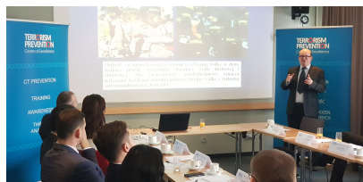
IV National meeting - Warsaw