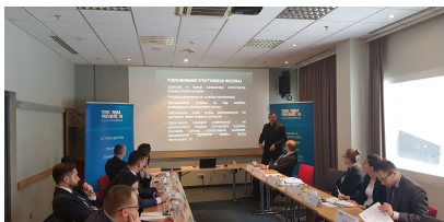
IV National meeting - Warsaw