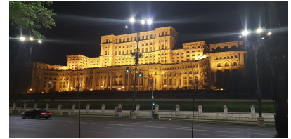
International meeting - Bucharest (Romania)

The role of the aforementioned services and institutions in immigration procedures was discussed during the meeting. The scope of actions taken in counteracting the radicalization process was established, with indication of challenges and problems related to the inflow of large numbers of immigrants. Recommendations regarding the functioning of the terrorism prevention system on the territory of the EU, including in particular in the Republic of Poland and Romania were adopted at the end of the meeting.