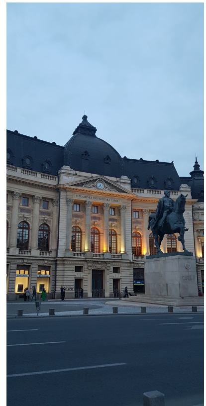
International meeting - Bucharest (Romania)